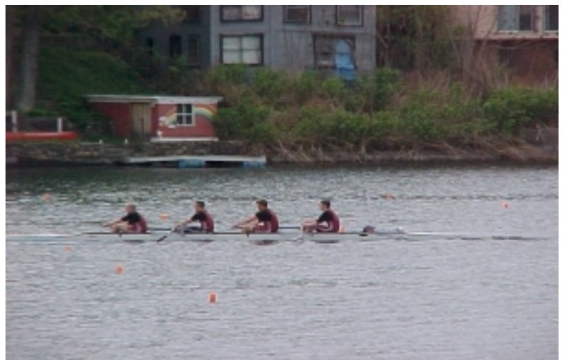
AVAYA Gold Medal Four